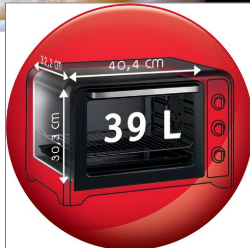
OPTIMO 39L OF484811