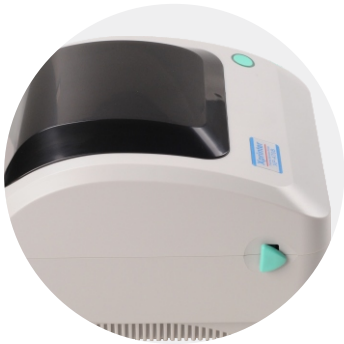
Streamlined Industrial Design.