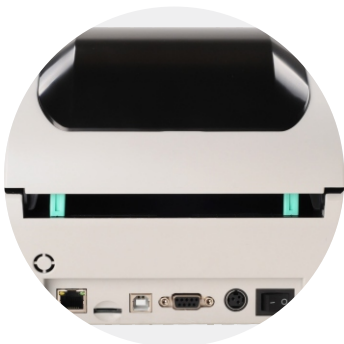
USB 2.0 Interface, High Speed Printer.

XP -470B is professional thermal direct label printer produced by Xprinter.